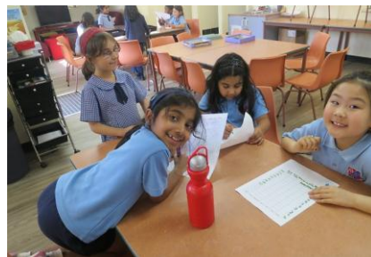
Homework time at Holsworthy OOSH

Unfortunately due to Federal budgetary restraints, the Federal Government's Active After-school Communities (AASC) program will finish at the end of 2014 and not recommence in 2015.